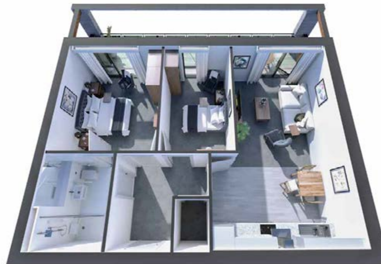
*2 bed floor plan shown

Everything is designed to make your life as easy as possible, including level access showers, easy to use fitted kitchens and accessible power points. Most apartments benefit from either a balcony or patio area, allowing you to make the most of the summer outside.