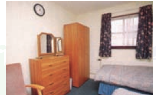
Khubsuret House - Guest Room

A Scheme Manager, while on duty, is available to help meet the welfare needs of the tenants by providing the security, advice and support that is often required in old age, by co-ordinating contact with different support agencies.